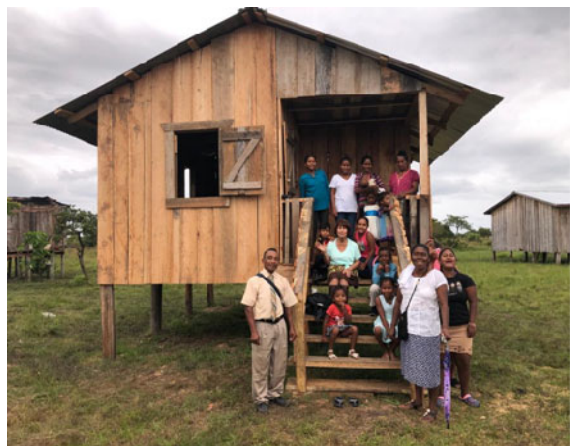
Donations from the Rotary Club made it possible for this mother and her seven children to have a new home. ***These are the before and after pictures of her home.***